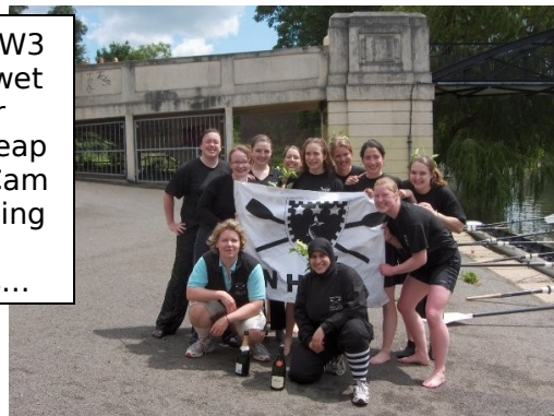
New Hall W3 dripping wet from their exciting leap into the Cam post winning Blades. Show offs...