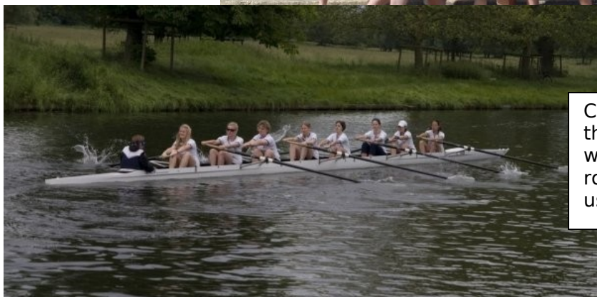
Can you spot the alumnae who wanted to row back with us?!