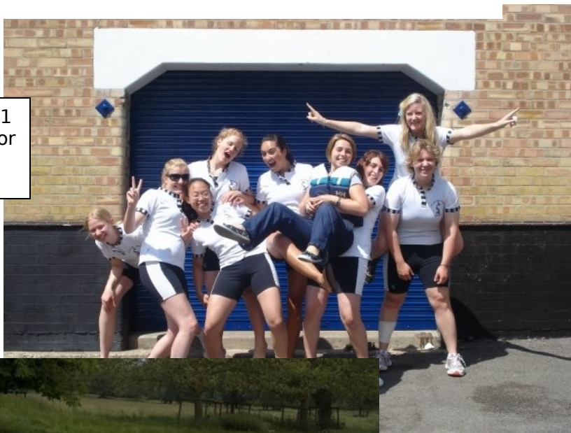
New Hall W1 preparing for the Mays!

Murray Edwards College Boat Club Vice Captain